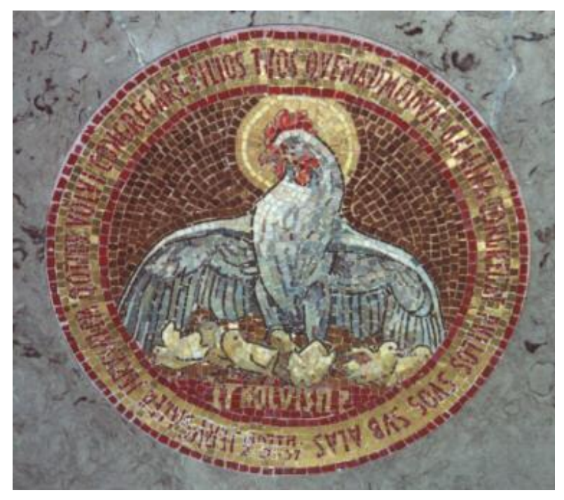
Mosaic, Dominus Flavet Church, Mount of Olives,