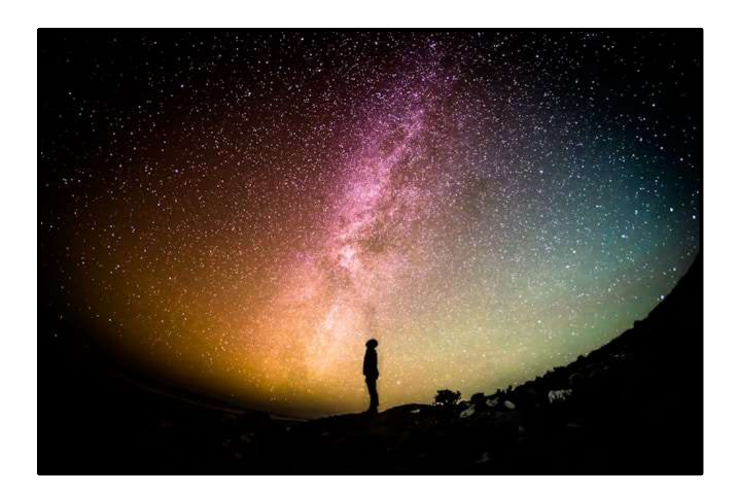
Living in Wonder and Trust Paul's Letter to the Ephesians 8<sup>th</sup> Sunday after Pentecost July 14, 2024