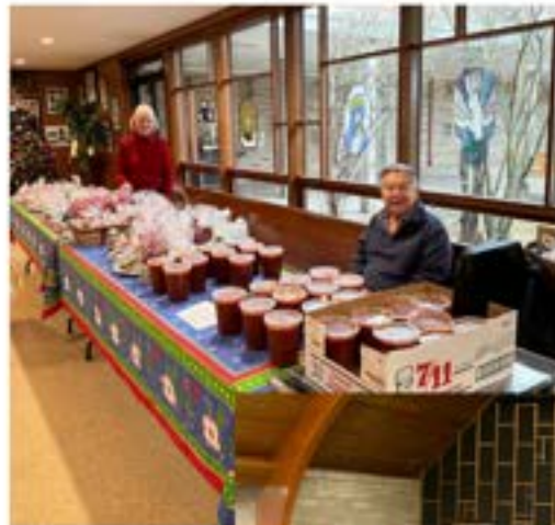
Christmas Cookie & Pasta Sauce Sale