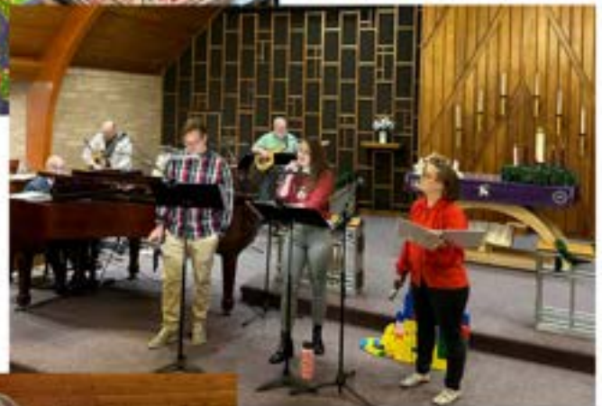
Lessons & Carols