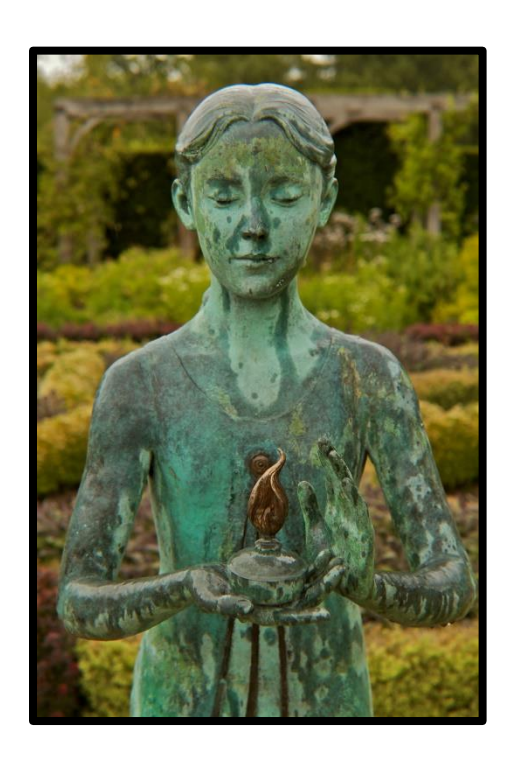
A Season of Creation 18<sup>th</sup> Sunday after Pentecost September 22, 2024