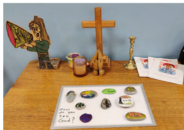
Peace Stones Hope Paintings